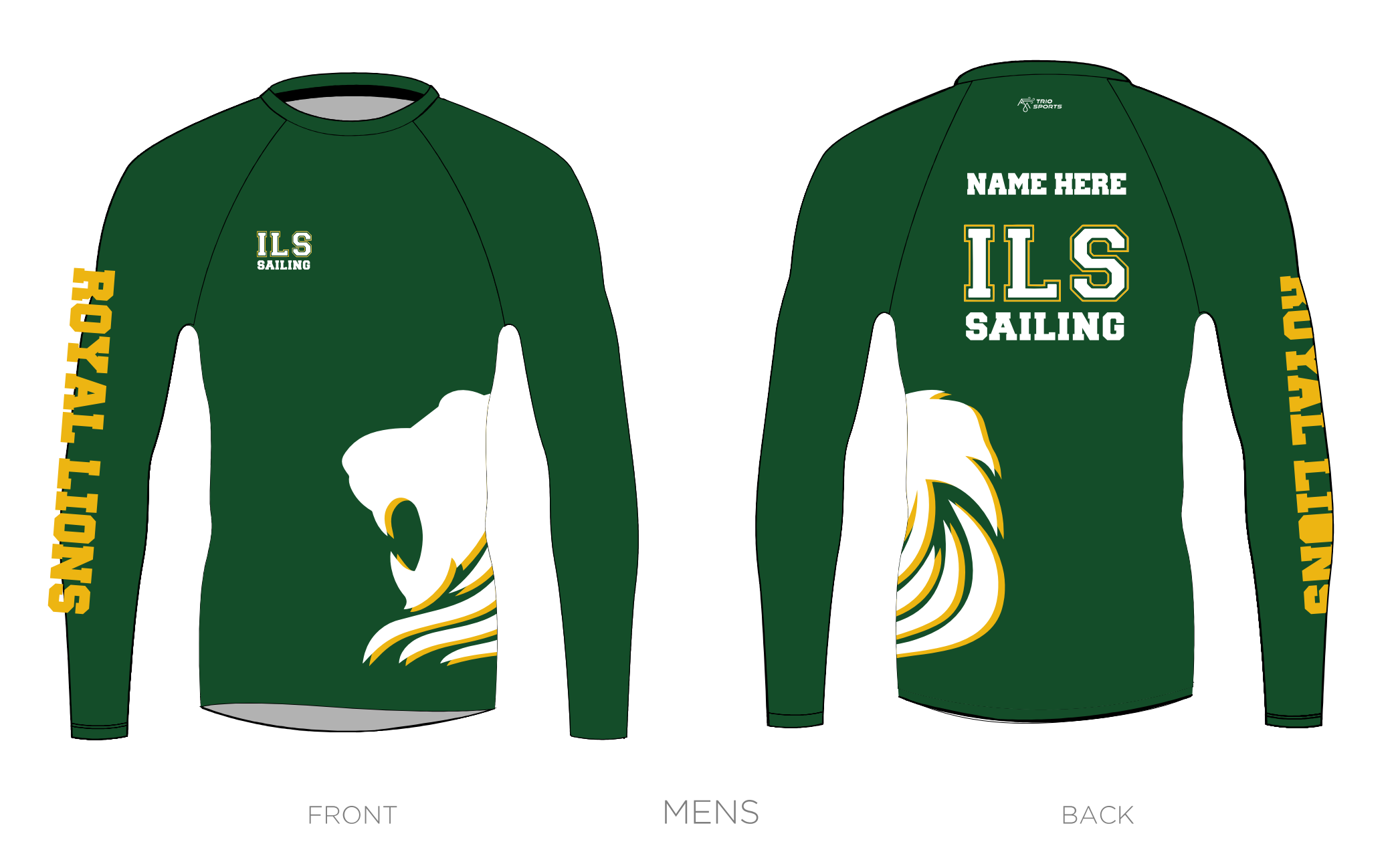
Final proof for customers approval